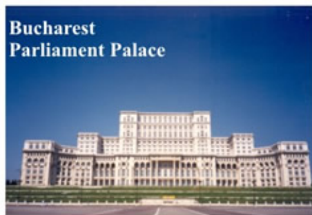
Bucharest Parliament Palace